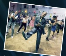
Lindy Club Dancers